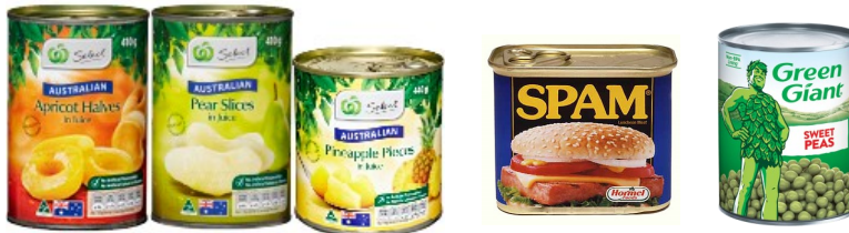
Name Brands are Copyrighted and are Registered Trademarks of their respective companies.