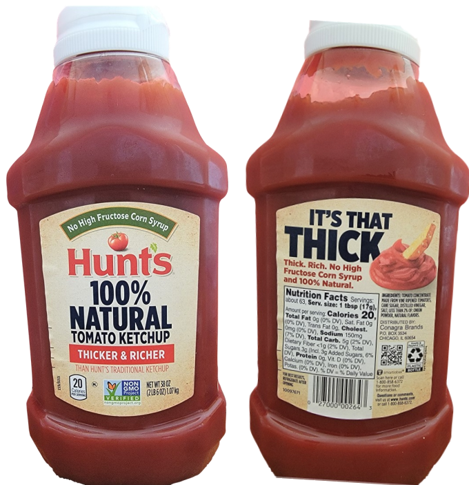
FRONT OF BOTTLE

After tasting this new Hunt's Ketchup, We believe it to be the best Ketchup.