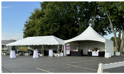
Pictured above is the temporary space created by Juday Creek for the Kickoff Classic Outing

Juday Creek was able to quickly pivot and set up temporary facilities so golf could be played and outings could be held at