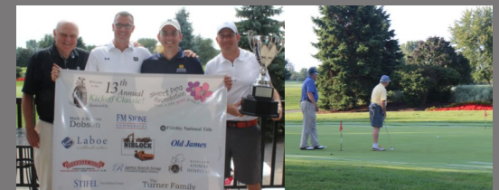
2016 Kickoff Classic Winners!