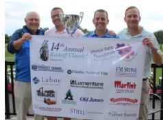
2017 KOC Winners!

The Sweet Pea Foundation's 14th annual Kickoff Classic golf outing was a huge success raising over $10,000 with over 100 participants—our largest yet! Thank you to all who came out to play golf! A special thanks to all the event, food and hole sponsors, as well as those who donated door prizes. We have listed some of the sponsors on the back of this mailer and the complete list can be found at www.sweetpeafoundation.org .