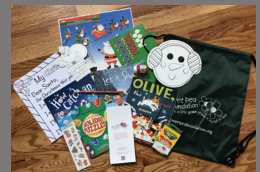
The contents of a Christmas-themed Hug!