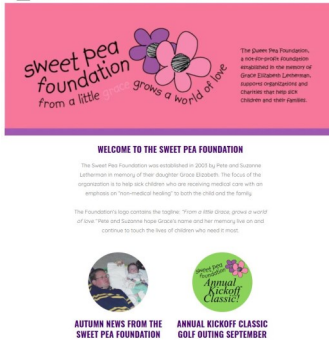
This is a screen shot of the new Sweet Pea Foundation website. The Foundation enters the 21st century with a redesigned website and online giving!

The Sweet Pea Foundation used quarantine to help bring the Foundation into the 21st century! The Foundation now has a new and improved website!