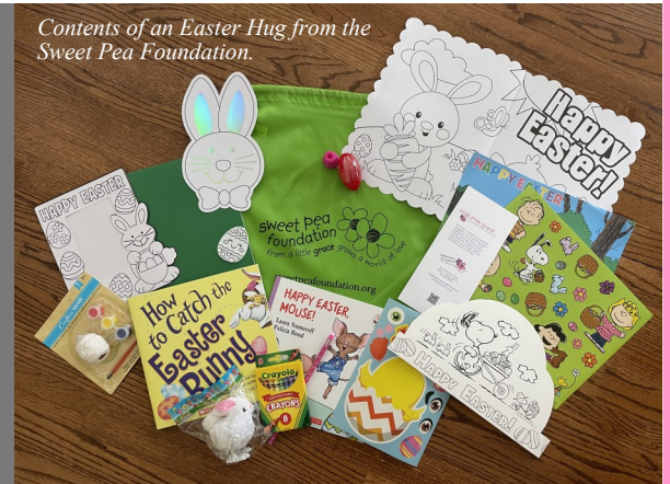
Contents of an Easter Hug from the Sweet Pea Foundation.