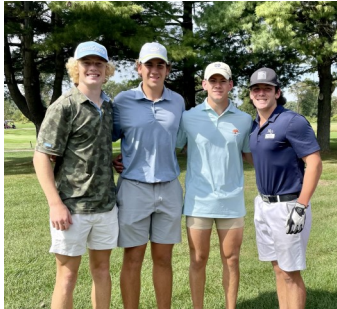
A golf team poses for a photo at the 20th Annual Kickoff Classic in September 2023.

The Sweet Pea Foundation will hold its 21st annual golf outing on Friday, September 20, 2024 , the eve of the Notre Dame vs. Miami of Ohio home football game. Last year the Foundation registered 20 teams. Help us increase that number by registering yourself or a foursome at sweetpeafoundation.org or scan the QR code on the bottom of this panel for access to an online form.