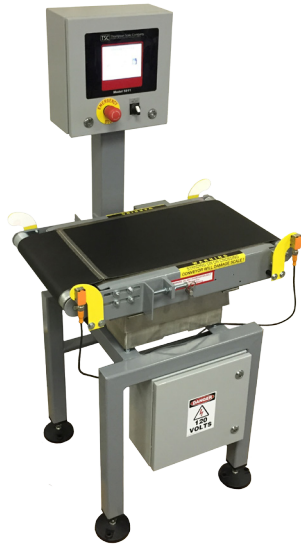
Single Belt Intermediate

Weights from 500 grams to 22 kg, rates to 60 per minute