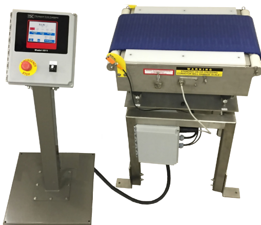
Center-Drive, Wash-Down Rated For Harsh Environments