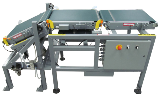
Multiple Belts, Variety Of Reject Options