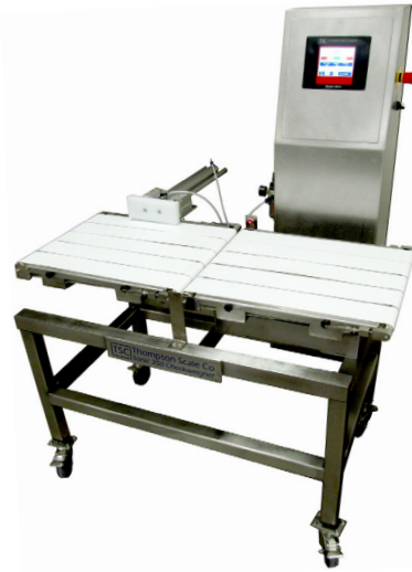
2-Belt Sonic 350SHD with Ram Rejecter

Weights from grams to 10 kg, rates to 220 per minute