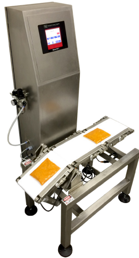
3-Belt Sonic 350MDR with Drop-Nose Rejecter