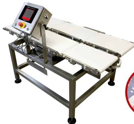
Dual-Lane Sonic 350SHD Checkweigher System