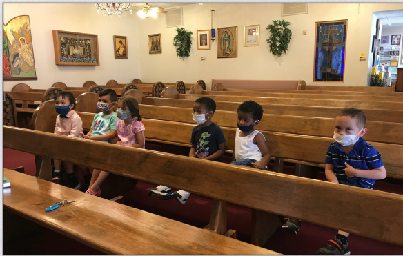
1st Church visit of the school year

Fall picture day will be on Wednesday, September 22nd, please be sure to drop off no later than 8:15 am to insure participation.