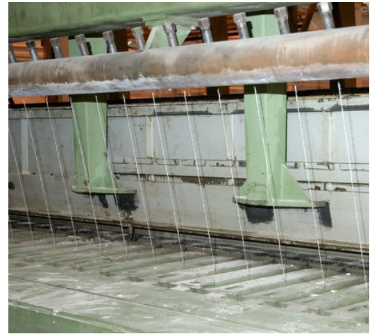
Figure 4: Cutting Machine with steel wires

After mixing, the slurry is poured into metal moulds in which the expanding agent reacts with the other elements. The mixing results in a reaction where small, finely-dispersed air spaces are formed. The moulds are sent to a pre-curing room for several hours. Next, the semi-solid material is transported to the cutting machine where the cuts are made using steel wires to form the sizes required for the building elements. The product consistency combined with our high precision cutting technology, results in pieces with dimensional tolerances for blocks (w, h, l) \pm 1/8" and for panels (w, h) \pm 1/8" , (l) \pm 1/5" .