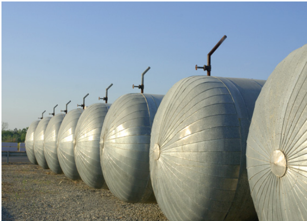
Figure 6: Exterior view of Autoclaves