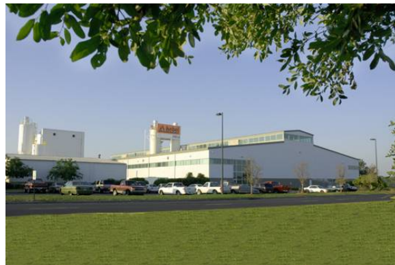
Figure 2: Xella Plant in Adel, Georgia