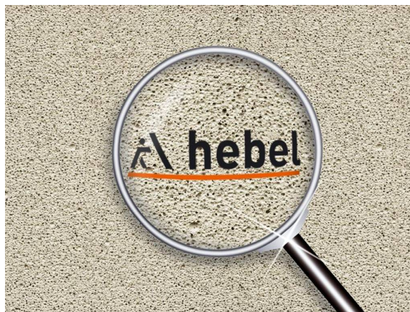
Figure 1: Hebel AAC

Panels of Hebel AAC are rapidly becoming the building blocks of a new, greener world. Thousands of architects, engineers, and builders around the world validate the properties of Hebel AAC in their own work because of its proven advantages for more than 80 years.