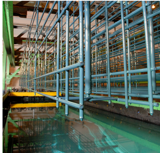
Figure 8: Anticorrosive Agent Application to Reinforcing Wires

Our plant is inspected on a regular basis by Underwriters Laboratories (UL) Follow Up Services.