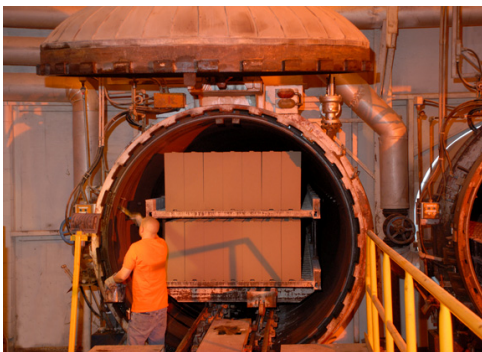
Figure 7: Interior view of Autoclaves

The final phase in the production process is steam pressure curing in autoclaves for up to 12 hours. Block, panels and other AAC elements are removed from the autoclave, packaged and sent to the finished product storage.