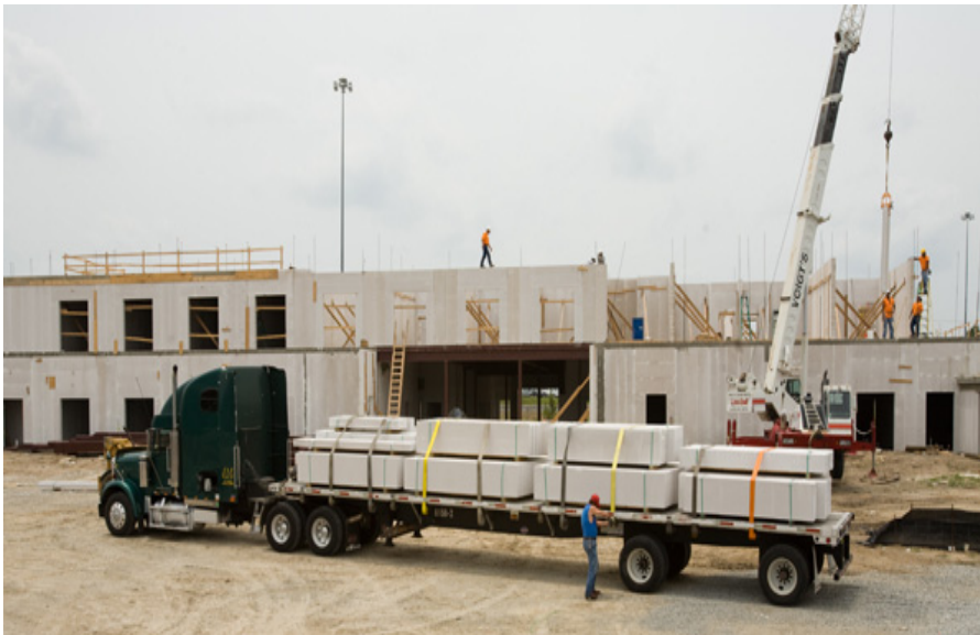
Figure 10: Hebel AAC Delivery to Project Site

Hebel AAC is shipped by trucks, platforms, or multimodal containers, etc. They can be transported by road, train and by sea for international projects. Hebel block and panel pallets should be handled by forklift trucks and/or cranes with appropriate straps to avoid damage to the material.