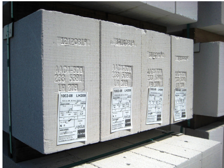
Figure 9: Material Identification

Reinforced panels are marked before autoclaving with a stamp code containing information about date of production, mould number, project number and placement position.