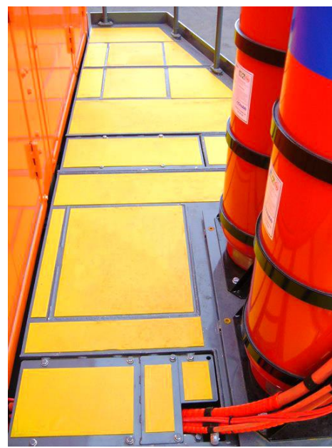
Custom-sized panels for heavy machinery