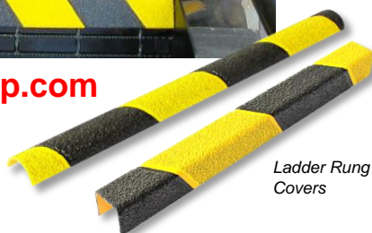
Ladder Rung Covers