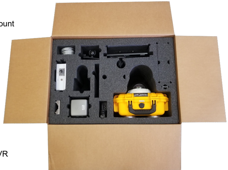
Reusable Packaging (Cardboard Box)