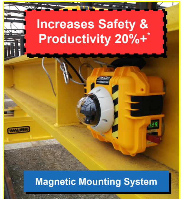
Rapidly Deployable Wireless Camera HoistCam Armored Dome HC180i (Industrial Series)