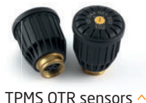
TPMS OTR sensors ^