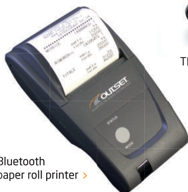
Bluetooth paper roll printer >

T1 is the new concept of on-board weighing and control of tire pressure and temperature for earthmoving machines, mining and logistic applications, in one device. The innovative TX4+ bluetooth transmission module allows a direct and constant control of the loaded material and the condition of the tires of your machine through an Android App for smartphone or tablet. T1 manages digital pressure sensors for the hydraulic circuit connection and proximity switches or angle sensors for the weight reading ensuring accuracy and payload control in real time. In addition, thanks to the OTR TPMS wireless sensors, all information relating to the pressure, the temperature and the tire status is displayed in real time on the Android T1 App. All weighing and TPMS data can be transmitted via serial or via can-bus line to the on-board computer or directly in-cloud on external devices, maintaining control and management of productivity and safety of your machines.