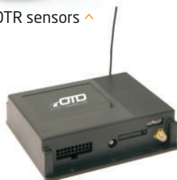
Outset tracking data ^