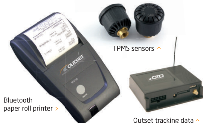
Bluetooth paper roll printer >