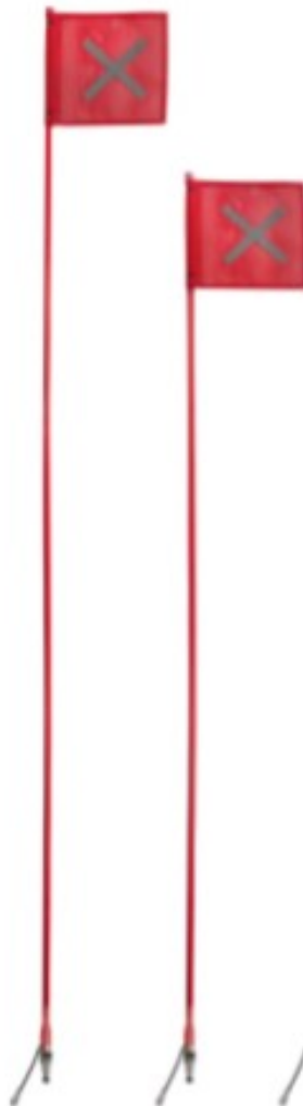
Multi LED's off