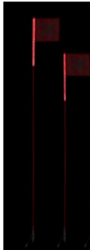
Multi LED's on