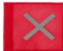
Part #: FX