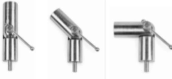
180 degrees 45 degrees 90 degrees