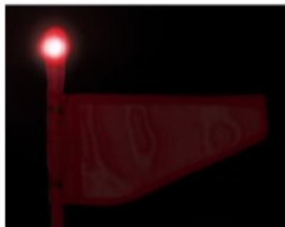
Part #: L