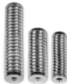
Part #: LS MS SS

Buggy Whips can be made with different lights, bases and flags, as you choose. All lights are LED. Our quick release is made from stainless steel, and fixed bases are zinc plated steel, nyloc nuts are used to help prevent theft.