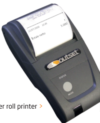
Paper roll printer >