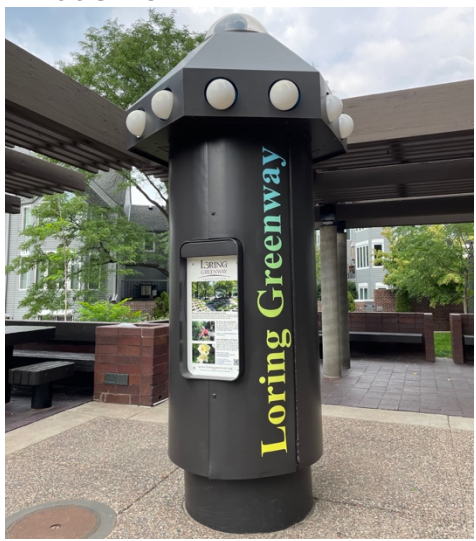
All-season beauty. See page 2.