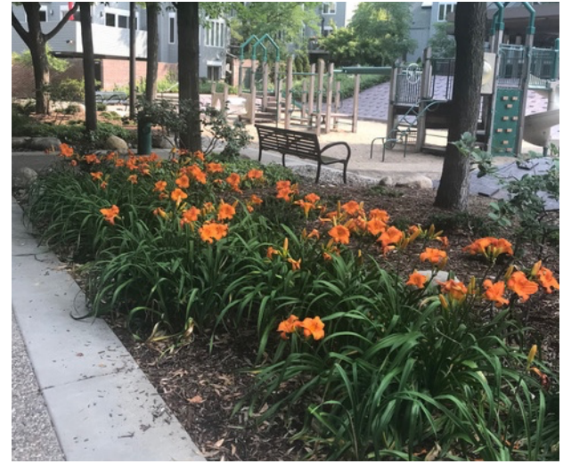
According to University of Minnesota Extension, daylilies do best in moist soil with at least six hours of direct sunlight. Perhaps this summer's persistent sun and hand-watering by LGA volunteers explain why the Loring Greenway daylilies were so spectacular this year.