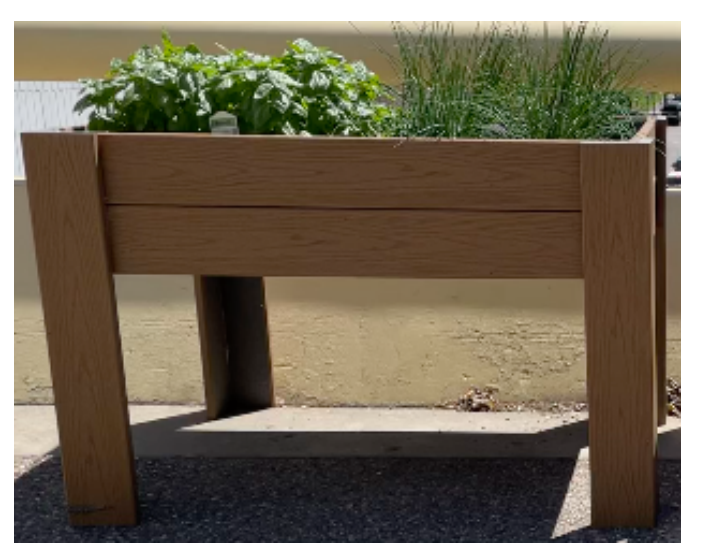
The Herb Garden is Back! Snip some parsley or basil to add flavor to your favorite dishes.