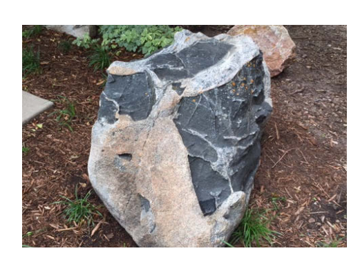
Gordy and Faythe Thureen transported this rock from their farm in East Grand Forks, MN to the Loring Greenway at the northwest corner of their current residence, Loring Way. The rock was placed on the couple's rural property in 1995 to mark their 20<sup>th</sup> wedding anniversary.

Wood chip patches behind One Ten Grant and Loring Way back entrances provide the perfect relief area for your pup and thus reduce stress on plants. The dog waste bags are provided by LGA and One Ten Grant.