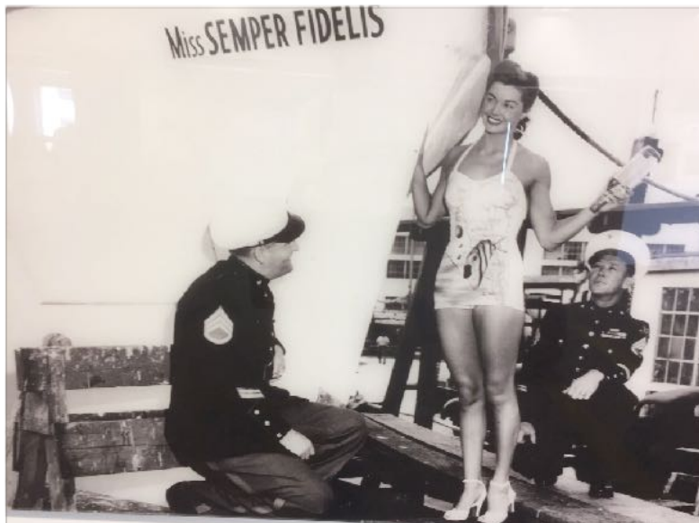
Esther Williams at dedication of U. S. S. Semper Fidelis

Guards are changed every thirty minutes, twenty-four hours a day, 365 days a year.