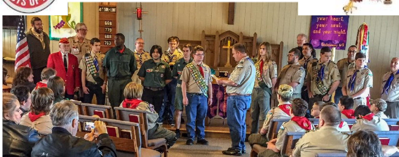
All those standing above are Eagle Scouts (notice the MCL red jacket) getting ready to once again take the oath of an Eagle Scout at Troop 273 Vernon Hills.

We continue to look for new members for our presentation team.