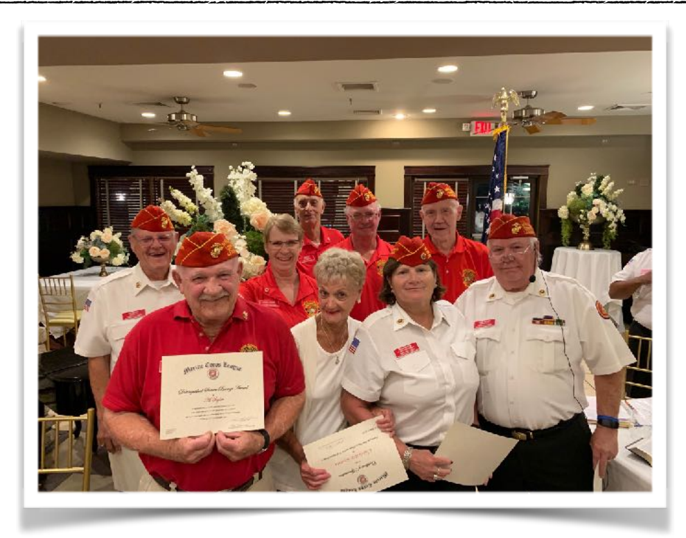
Many thanks to the VA Hospital Visitation Team