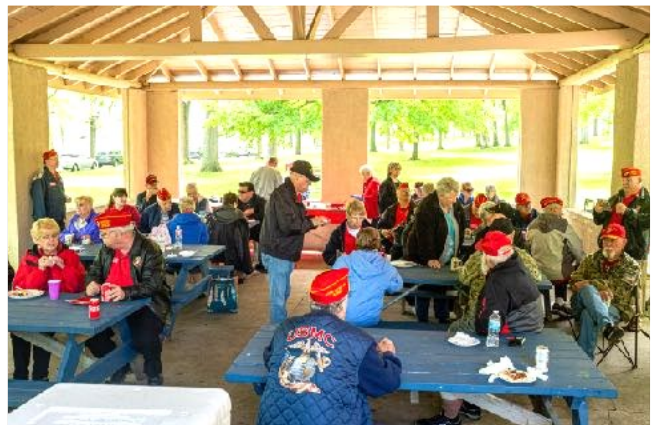
Couple of Images from our 2019 Memorial Day Cook Out!