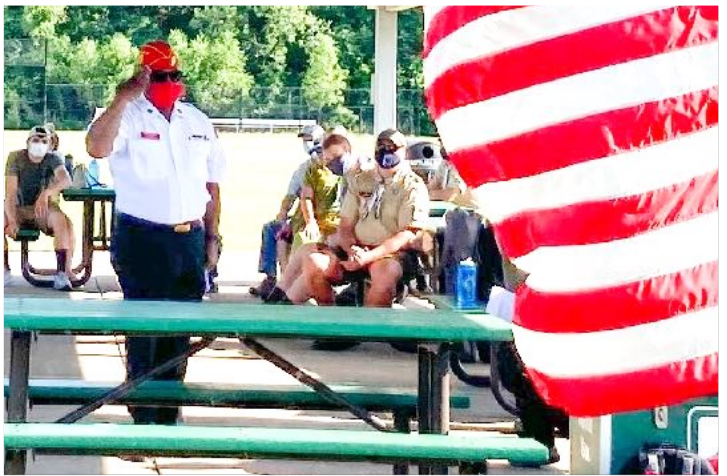
Eagle Scout Ka-Bar presentations. Notice our first female Eagle Scout.