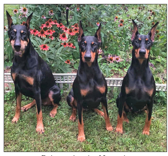
Reign ~ Avari ~ Namarie