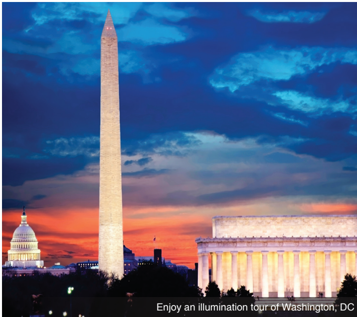
Enjoy an illumination tour of Washington, DC

biblical history, see the Garden of Eden and experience Noah's flood through exciting exhibits which bring the pages of the Bible to life through the retelling of its stories. Meals: B, D