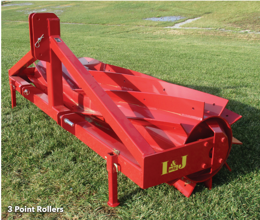
3 Point Rollers

Make the move to organic farming & reduce the amount of herbicides in your conventional farming program!