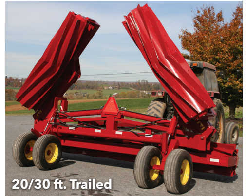
20/30 ft. Trailed