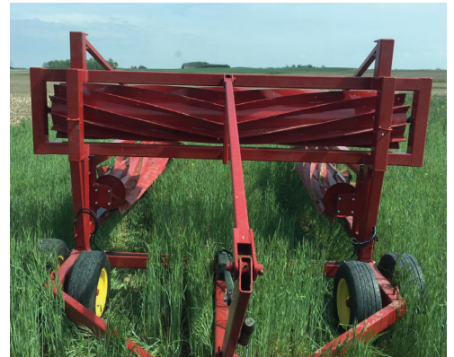
40/60 ft. Trailed