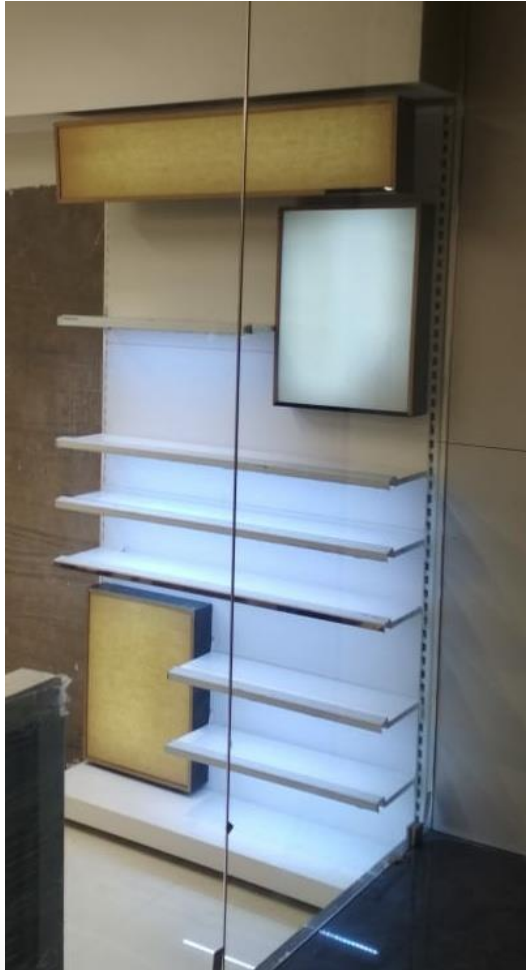
Display Retail Racks