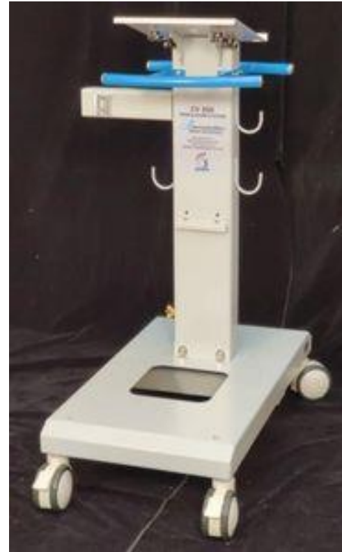
Ventilator Stand (Manufactured during the first wave of covid-19)