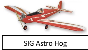
SIG Astro Hog