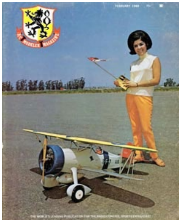
RCM Magazine – Feb 1969