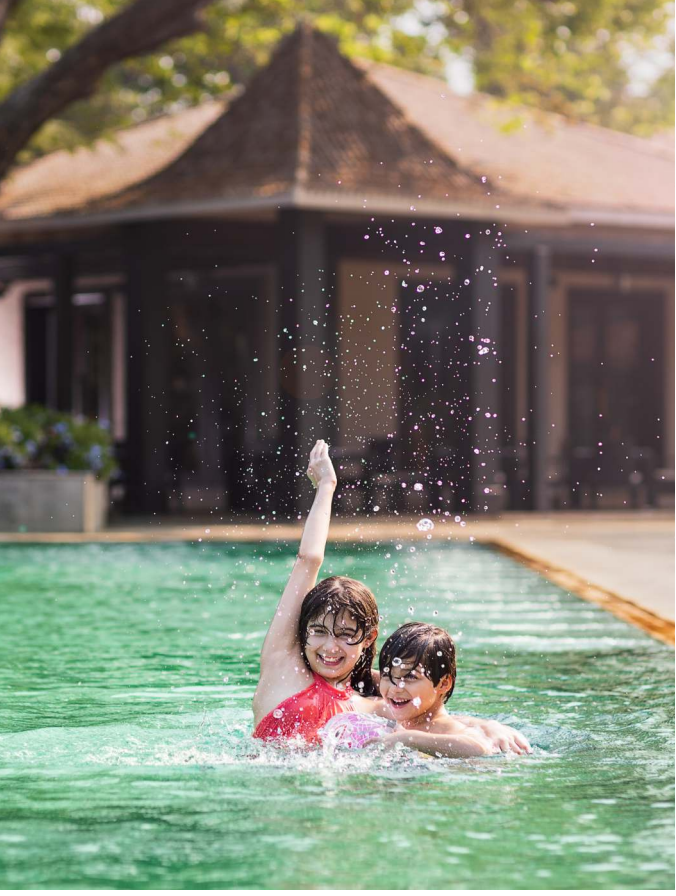
The Club Pool