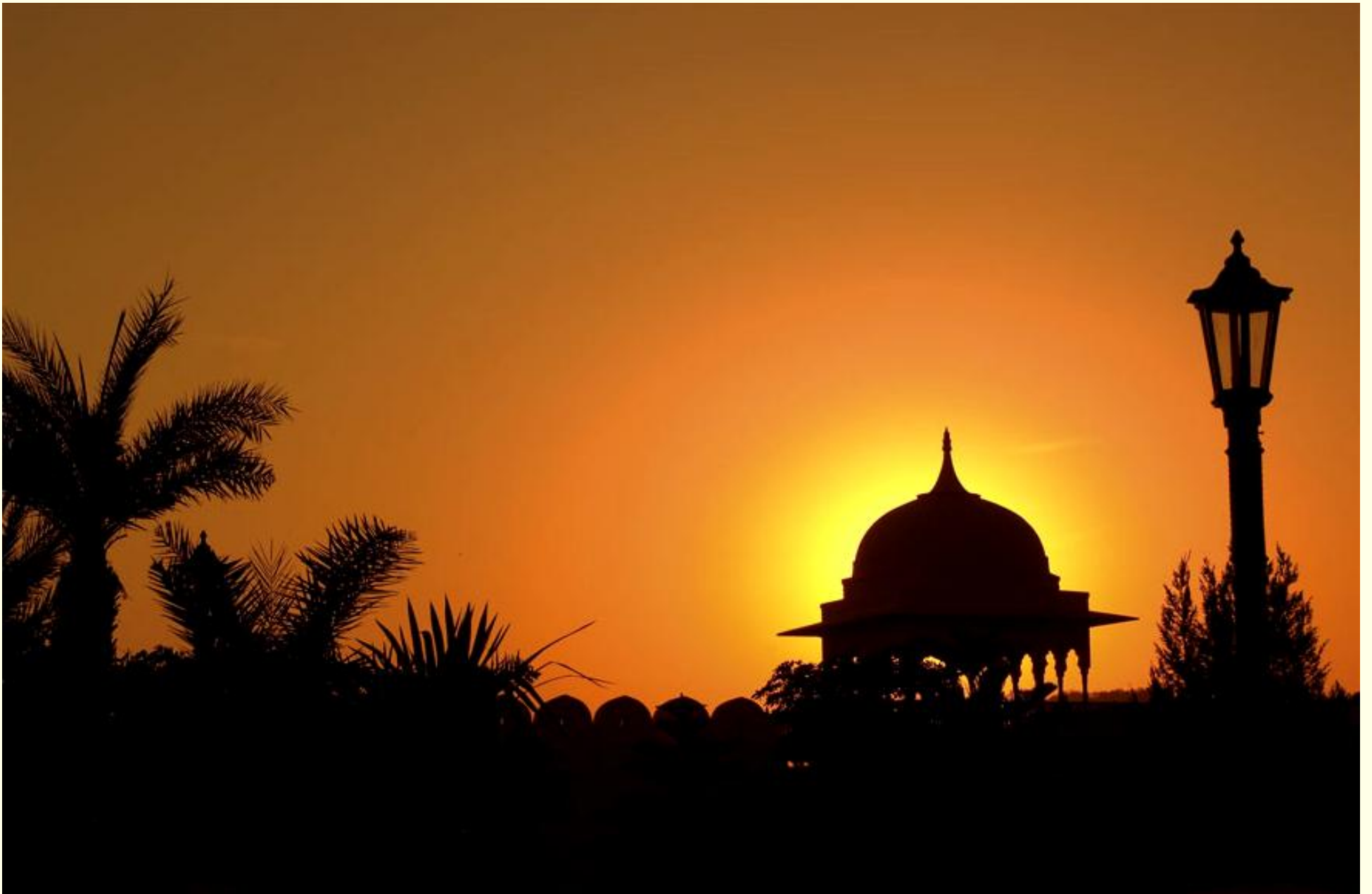
Sun Set in Aravalis