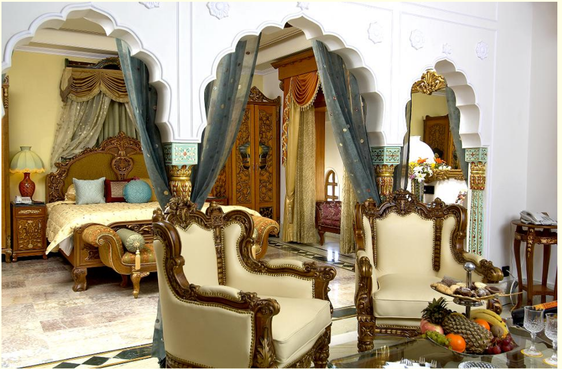
Paras Mahal Suite