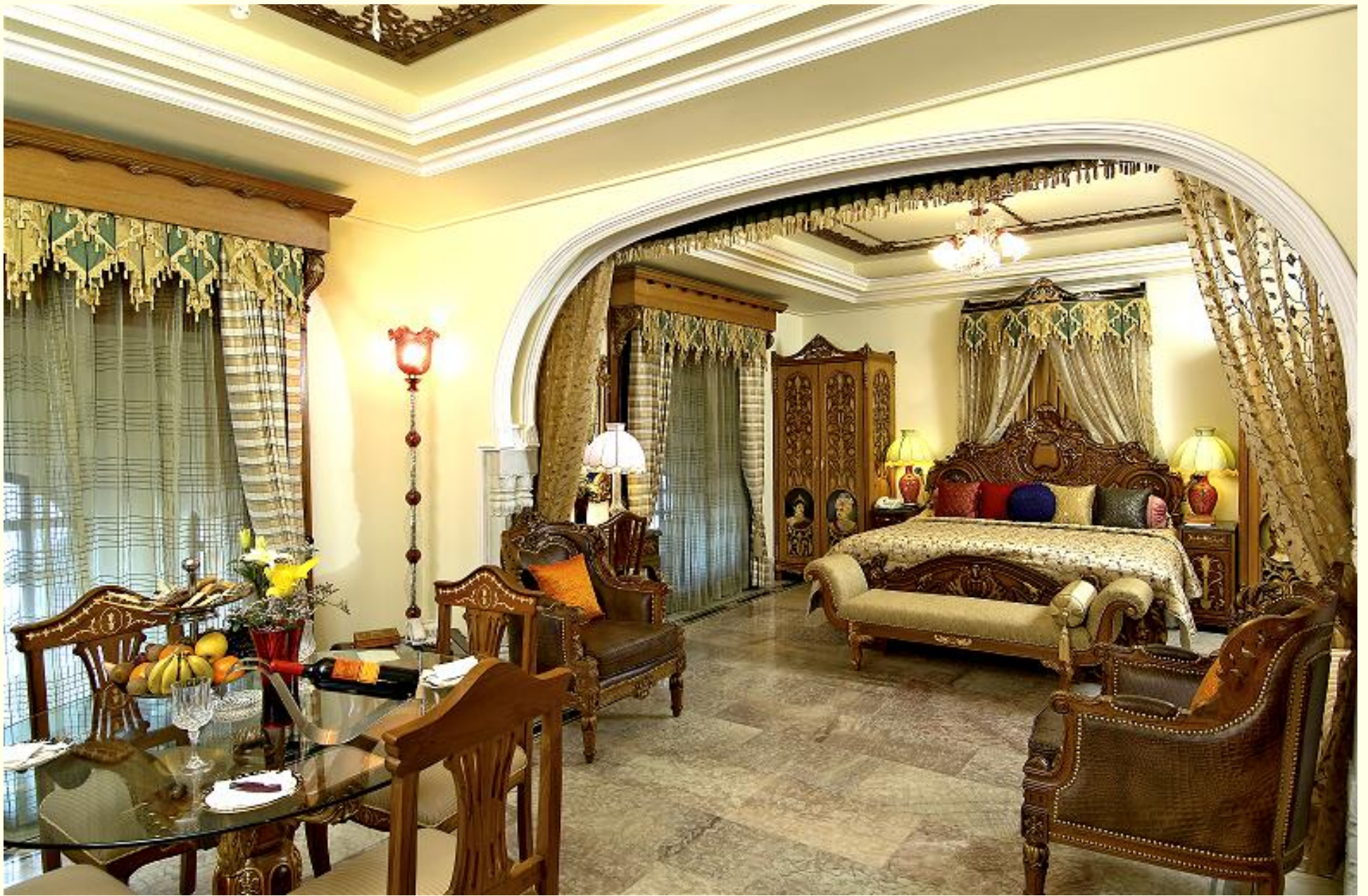
Moti Mahal Suite