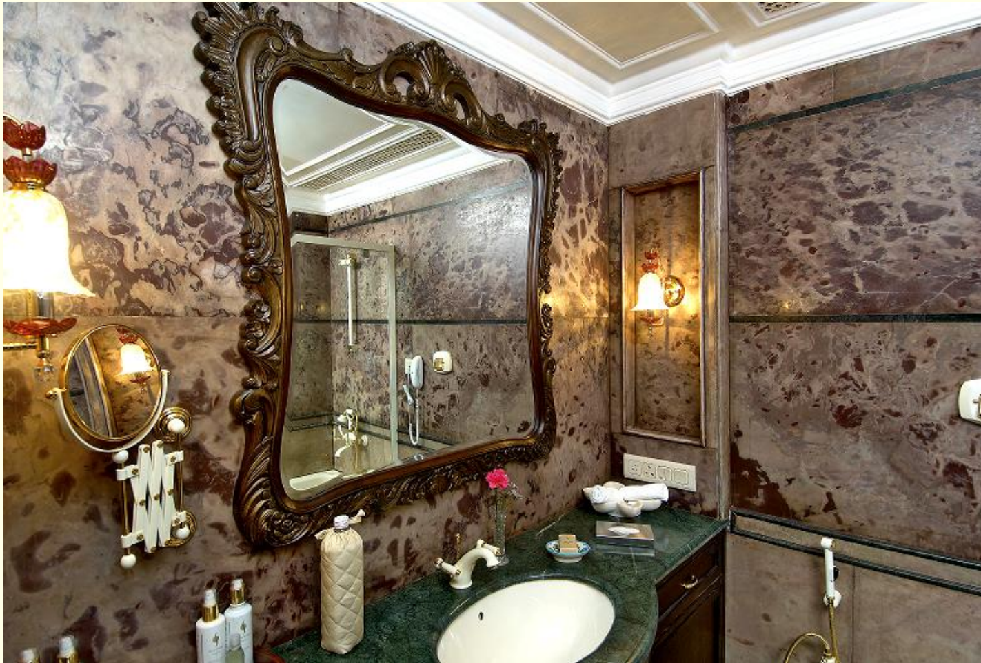
Elegant Room Bath