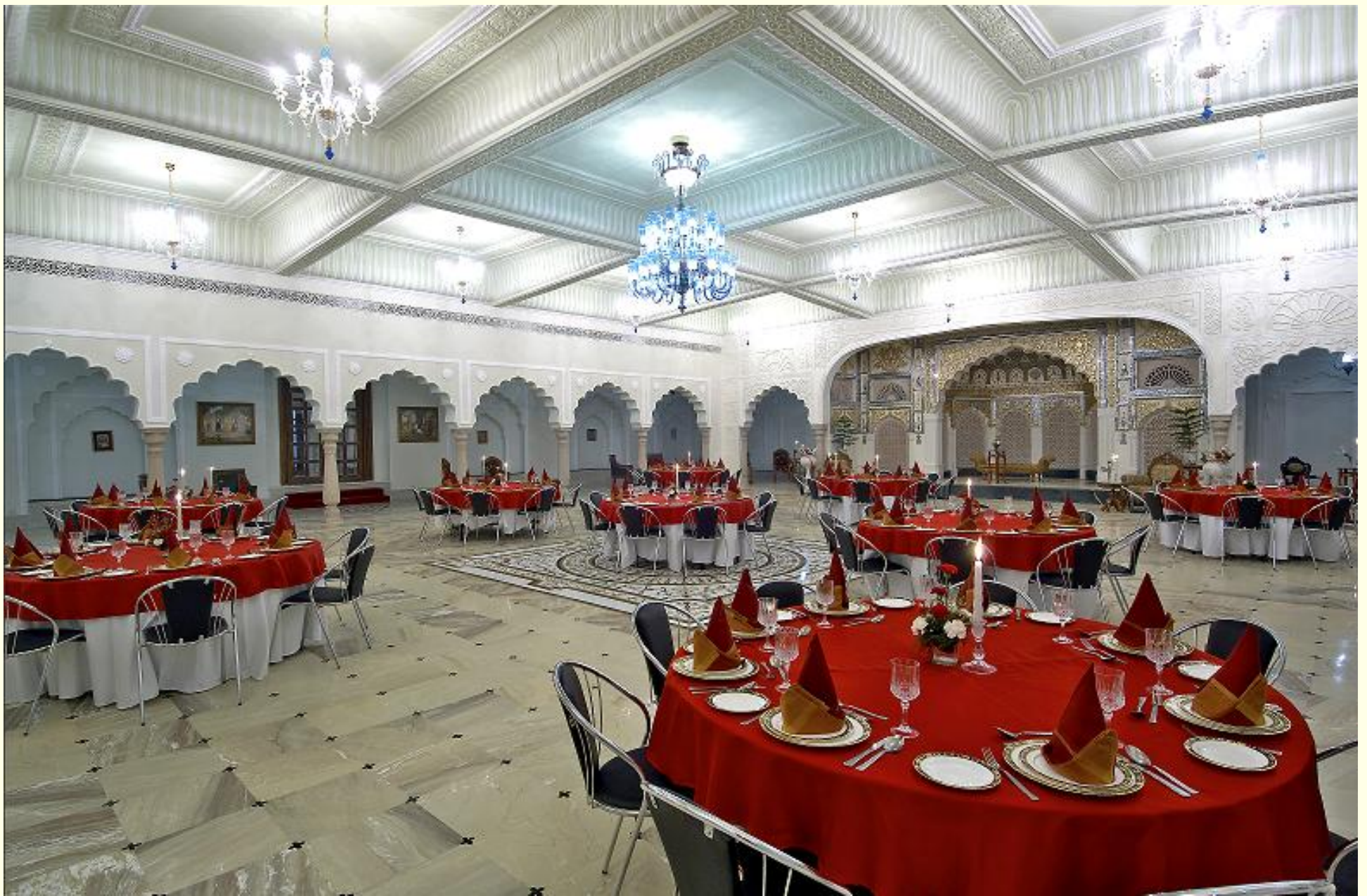
Presidential Ball Room