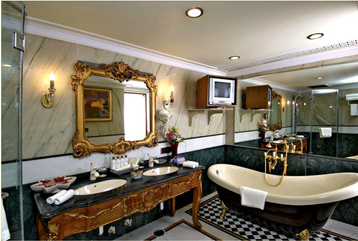
Paras Mahal Bath