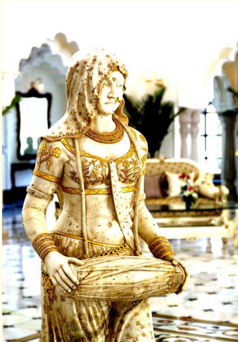
A marvel at Shiv Vilas