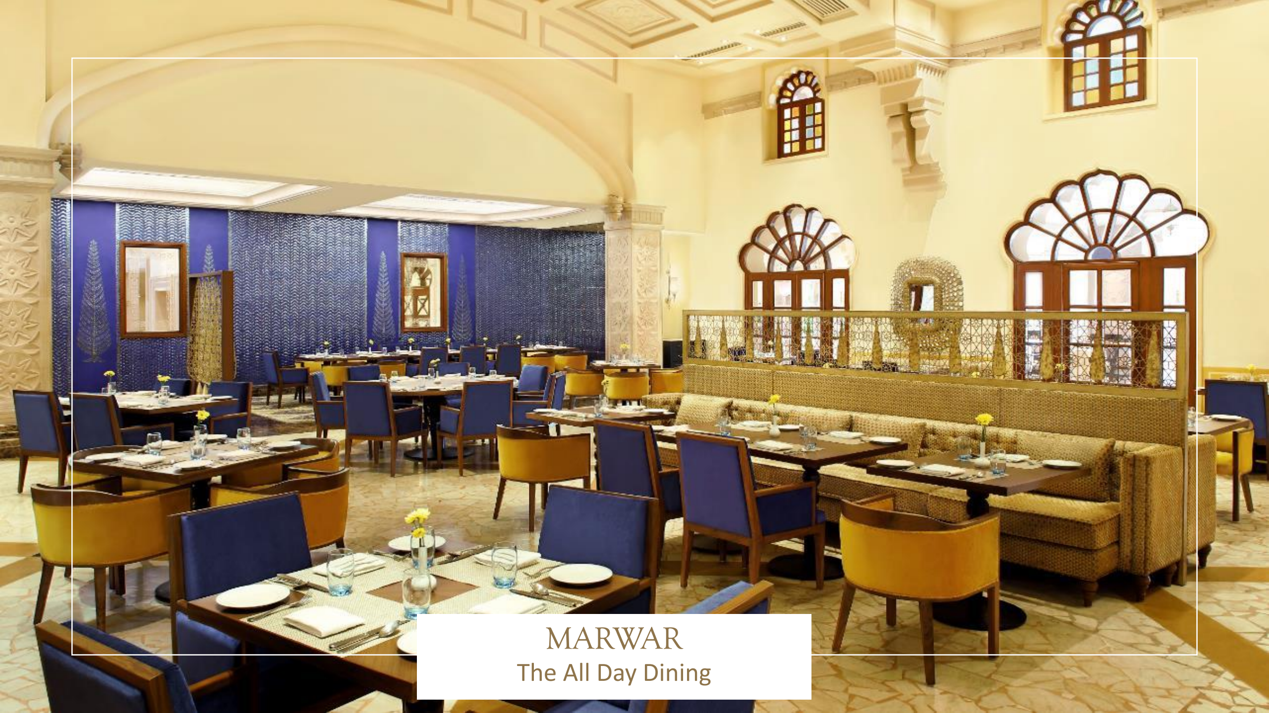
MARWAR The All Day Dining