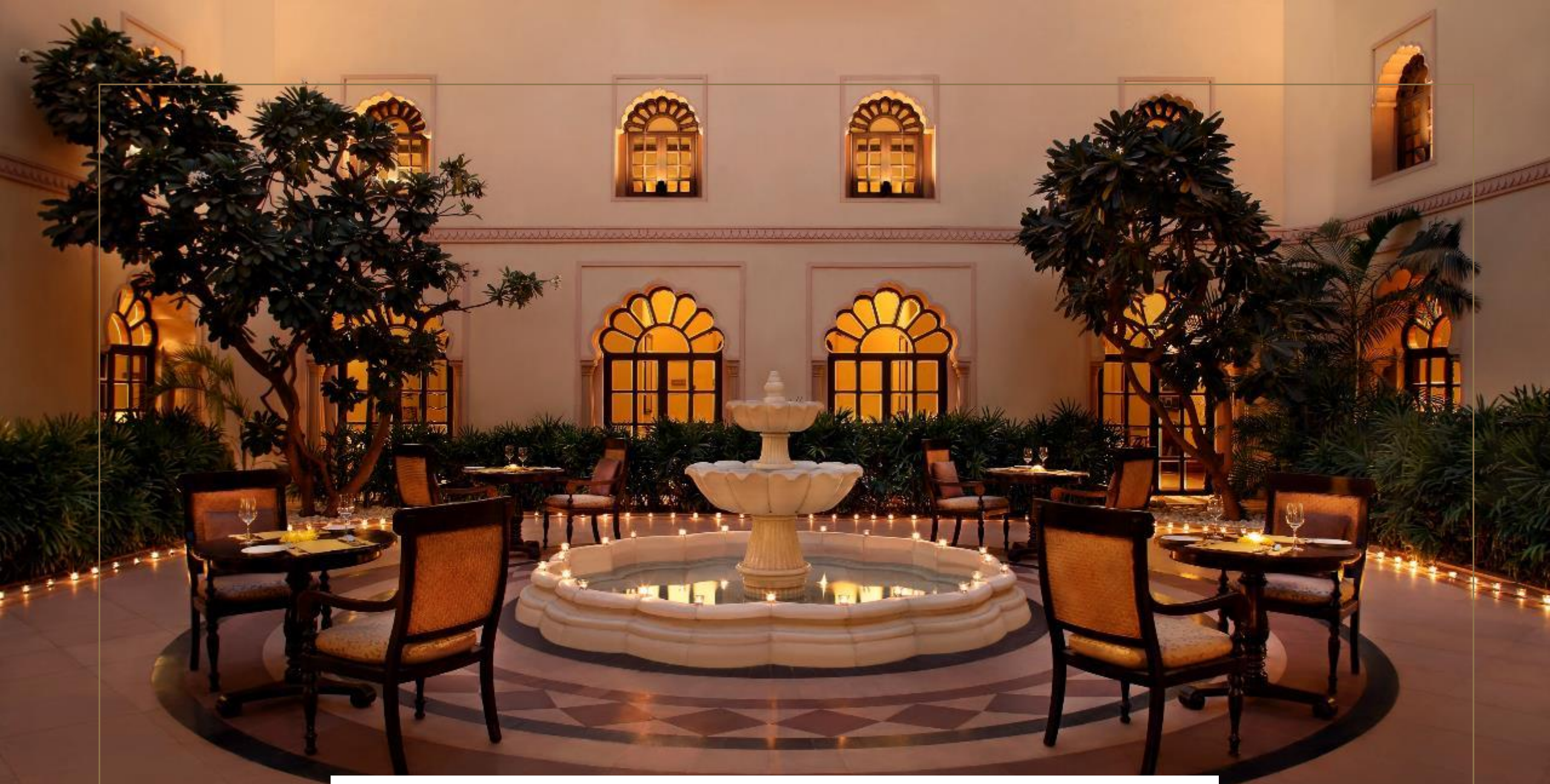
THE COURTYARD DINING EXPERIENCE