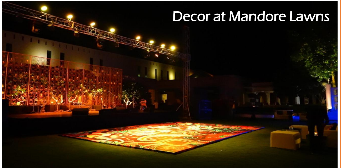
Decor at Mandore Lawns