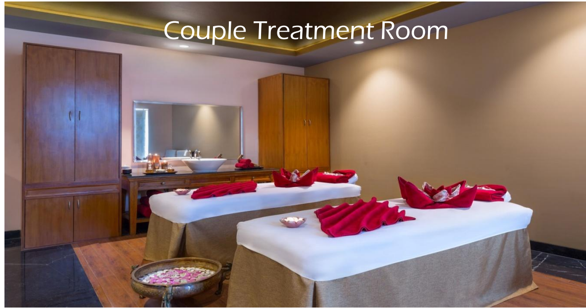
Couple Treatment Room