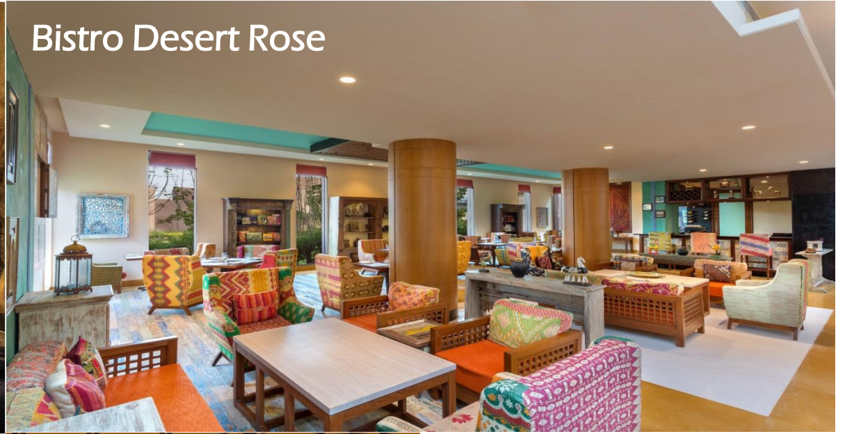
Bistro Desert Rose