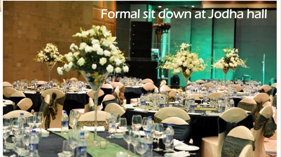
Formal sit down at Jodha hall