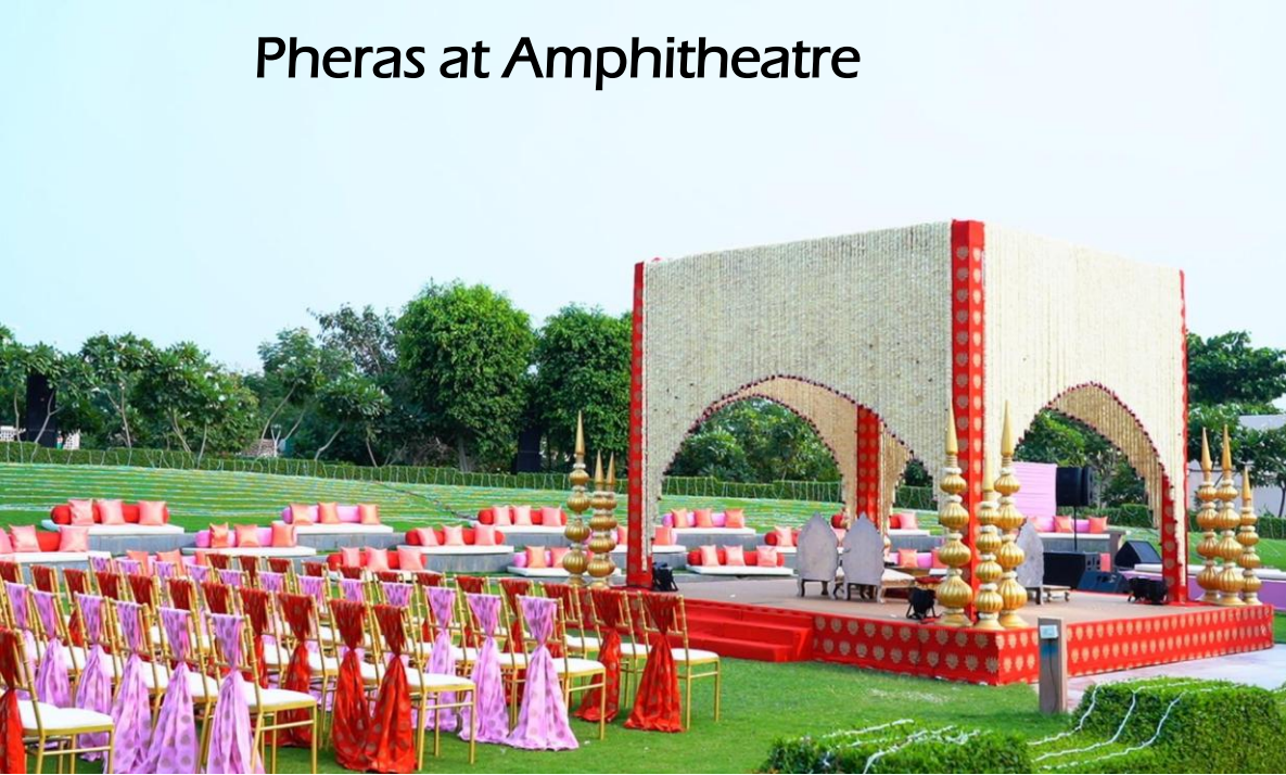
Pheras at Amphitheatre