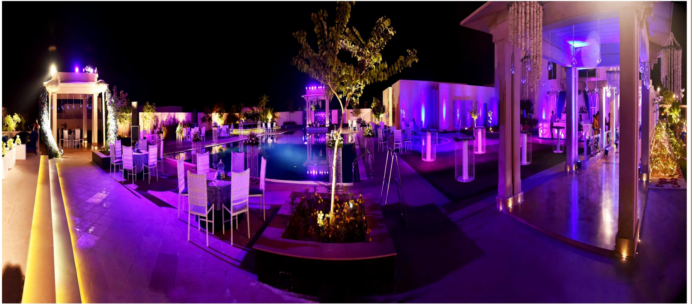
Poolside evening set up