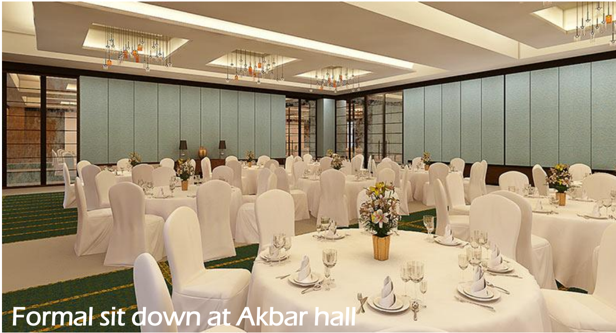
Formal sit down at Akbar hall