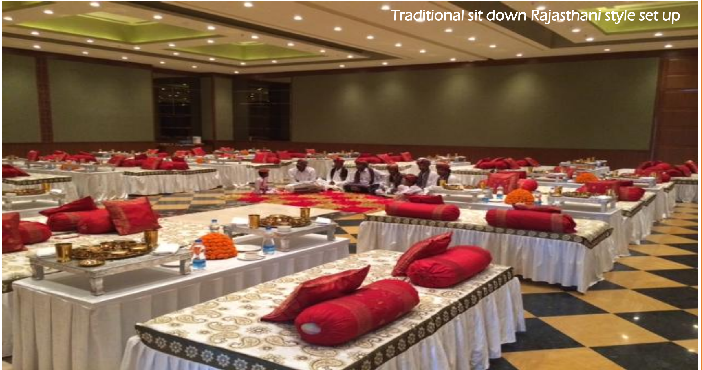
Traditional sit down Rajasthani style set up