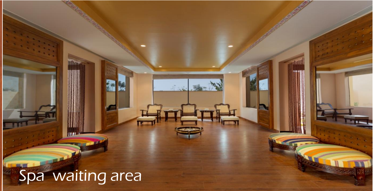
Spa waiting area