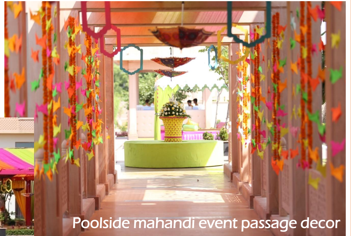
Poolside mahandi event passage decor