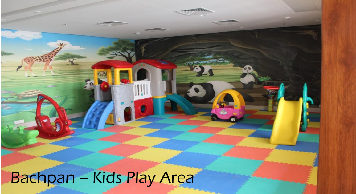
Bachpan – Kids Play Area