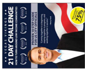
THE FILM: This is the film cover of "Vegas Vikings".