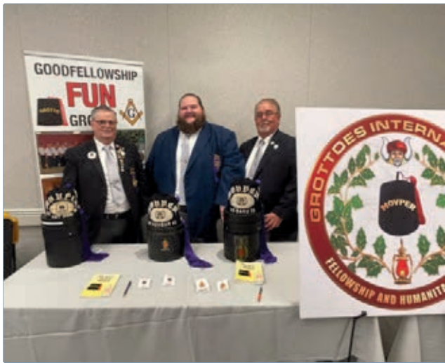
(above) Ohio Grotto Association officers attended the Grand Lodge of Ohio Annual Communication.