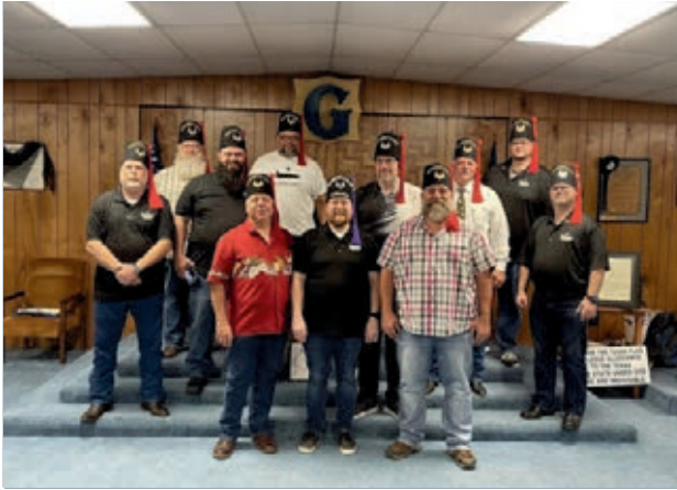
(above) Kumntakit Grotto adds 3 new Prophets!