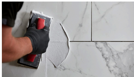
Non Shrink Grouts