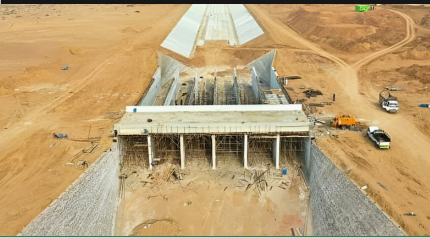
Kachhi Canal Project

Explore our portfolio of completed and ongoing construction projects where our high-performance construction chemicals have played a vital role. From commercial buildings and industrial facilities to infrastructure and residential developments, our products have been trusted by industry professionals for their quality, durability, and performance. Each project showcased here reflects our commitment to innovation, reliability, and excellence in construction solutions.