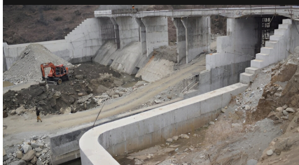
Karora Hydro Power Project

Admixture Used: BSC 3600 F Consultant: PEDO