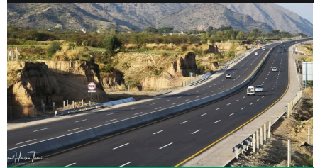
Hassan Abdal to Havelian E-35