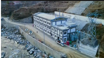
Jabori Hydro Power Project