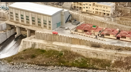
Daral Khwar Hydro Power Project