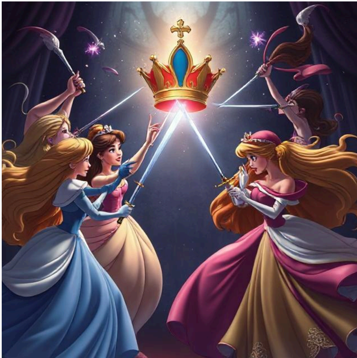
War of the Disney Princesses