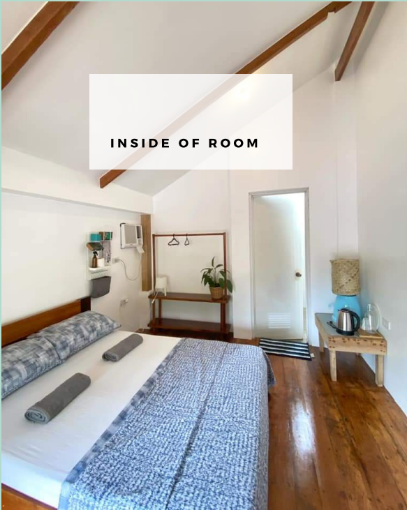
INSIDE OF ROOM

NEWSLETTER ABOUT OUR ISLAND ADVENTURES AND UPDATES