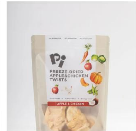
APPLE & CHICKEN TWISTS