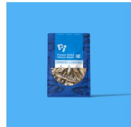
FREEZE-DRIED WHOLE SMELT