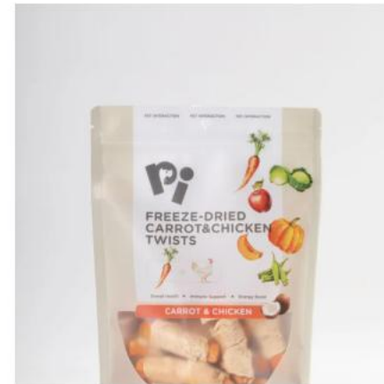
CARROT & CHICKEN TWISTS