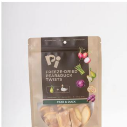
PEAR & DUCK TWISTS