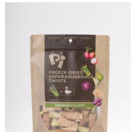
ASPARAGUS & DUCK TWISTS