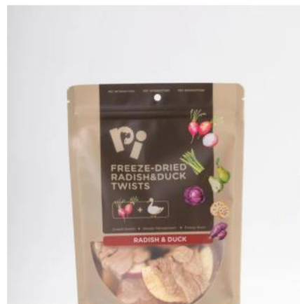
RADISH & DUCK TWISTS