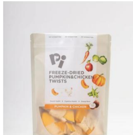
PUMPKIN & CHICKEN TWISTS