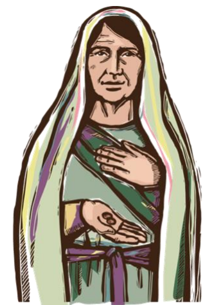
The Widow's Mite

But this is not why we give small gifts. Her gift, though it appeared small, was actually large. When we are tempted to give small gifts, it is precisely because we want them to be small! We don't trust the Lord to provide for us. We give small gifts because we lack faith in the One who created us, redeemed us, sanctifies and keeps us in the one true faith. We give small gifts because we doubt that God will really give us what we need and desire. We give small gifts because we are not content