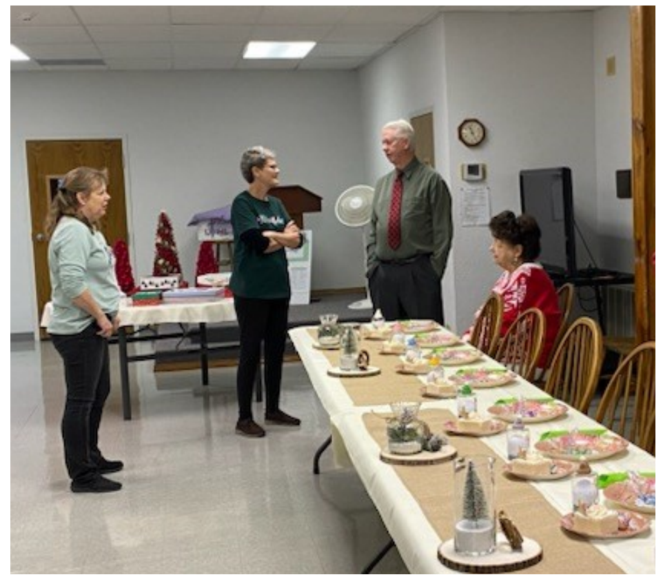
A couple more pictures from the LWML Christmas party held on December 8.