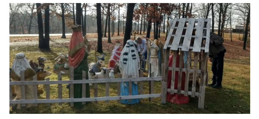
The beauty of Christmas is not in the presents but in His presence