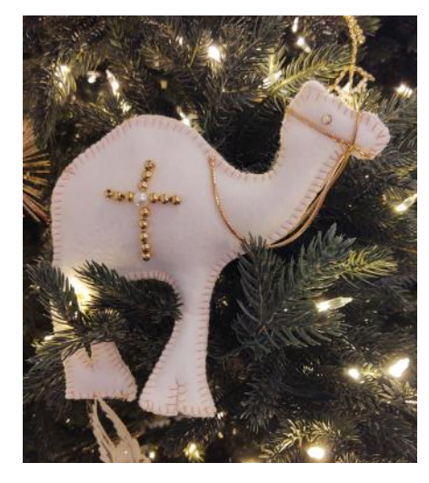
One of the many Chrismons made by the ladies of Peace.