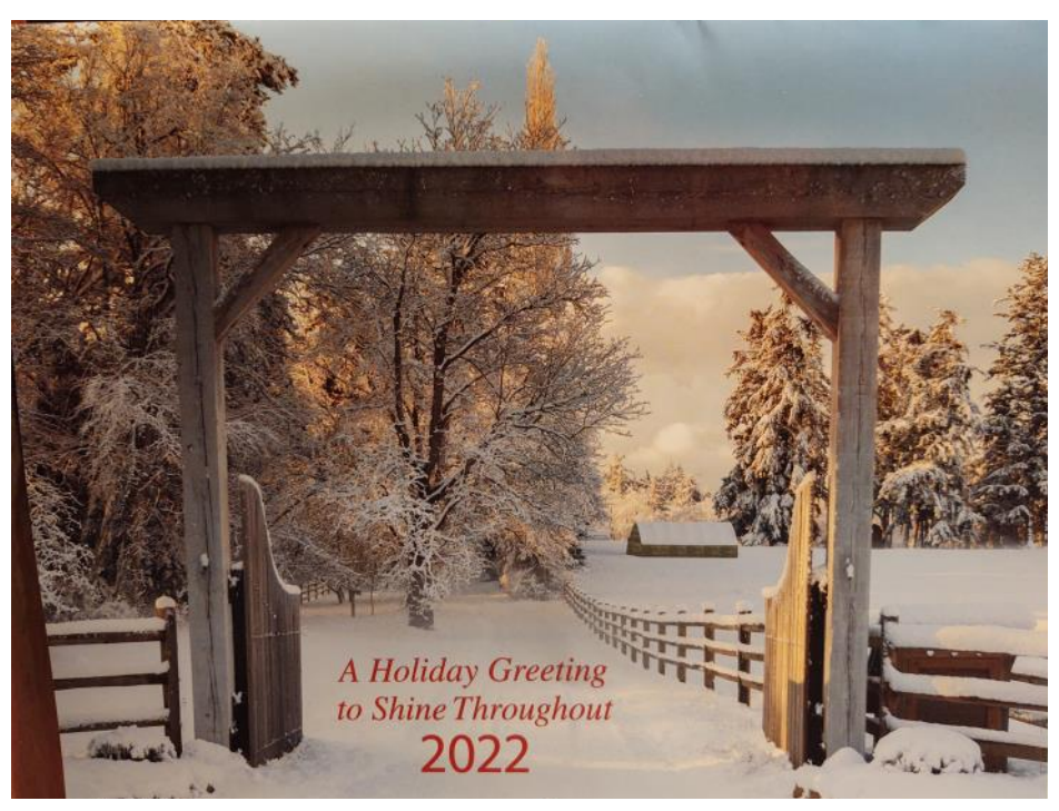
If you are still in need of a calendar, there are a few copies available on the table in the sanctuary or the credenza in the narthex.