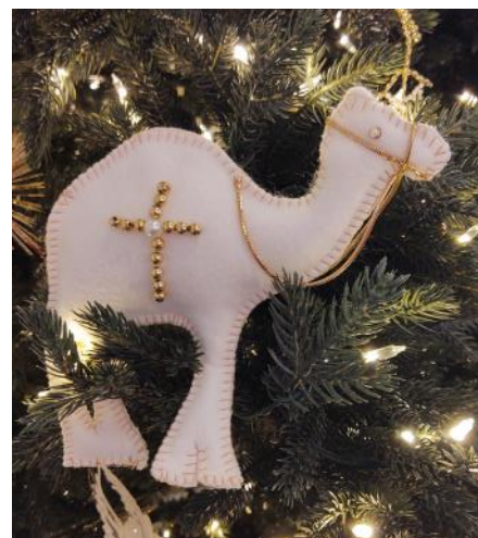
One of the many Chrismons made by the ladies of Peace.