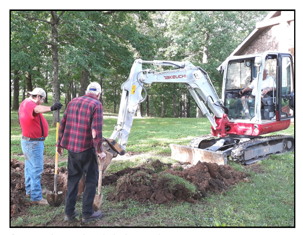
Repairs are being made to the broken waterline.