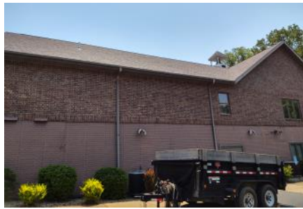
The church and shed roofs was replaced on Thurs., June 17 and Friday, June 18. A tree was also removed on Saturday, June 19.